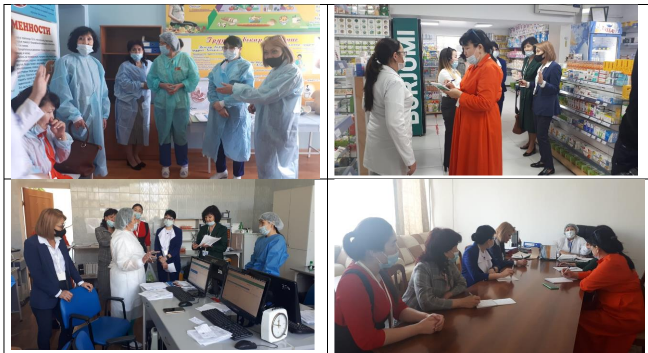
Photo 7. Visiting EEC clinical sites.

According to the programme, members of the EEC have demonstrated the information and educational platform Paragraph Bilim used for DL: electronic journal, schedule, statements, lists of groups, etc.