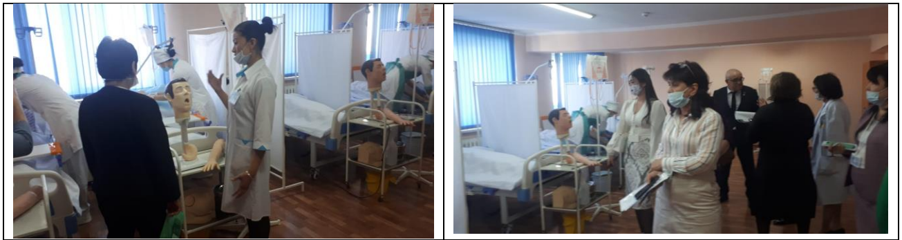
Photo 4. Overview of educational resources

On the same day, experts interviewed teachers offline, observing distancing and masking. Teachers answered questions about satisfaction with working conditions, wages, material incentives (bonuses, additional payments for leadership, methodological work, publications), spoke about teacher development activities, noted the high corporate culture in the college and ethical leadership. All noted that equipment is being purchased, great attention is being paid to improving the qualifications of teachers in terms of professional competence, attracting and supporting young specialists. The experts received answers about the teacher training programme, the financing of this training, the availability of certification in teaching methods for teachers and an established system of academic support for students.