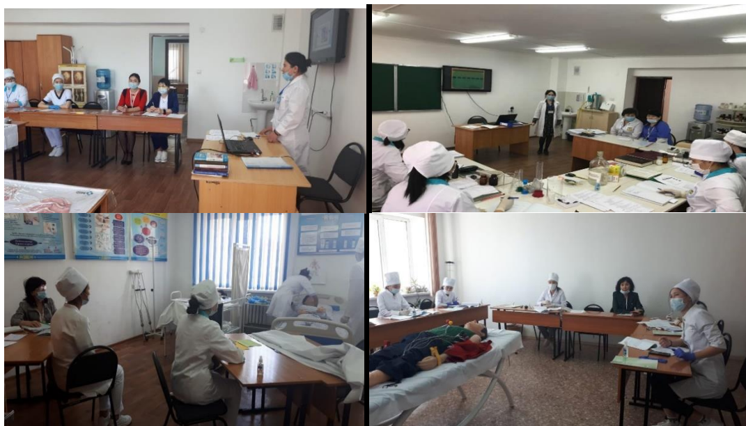
Photo 8. Visiting EEC practical training.